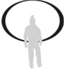
Light distribution traditional light