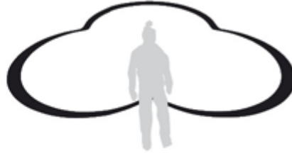
Light distribution Silva Alpha Intelligent Light

Silva Alpha Intelligent Light® is a light distribution technology. It combines a wide angle flood light with a long reach spot light. The unique light image gives the user peripheral and long distance vision at the same time. For a runner, cross country skier or mountain biker this translates into less head movement, increased control, better balance and more speed.